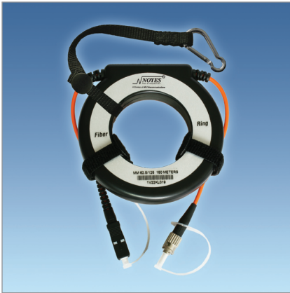
Fiber Ring, MM - 150 m