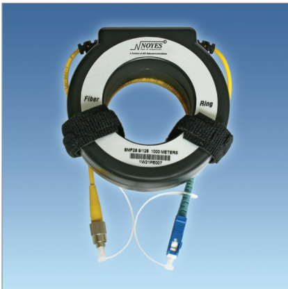
Fiber Ring, SM - 1000 m