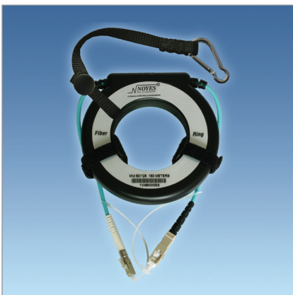
Fiber Ring, Laser Optimized