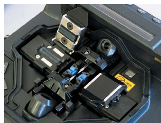
Top view of FSM-17S