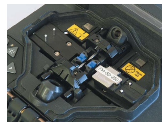
Top view of FSM-17S-FH

Specifications and descriptions are subject to change without prior notice.