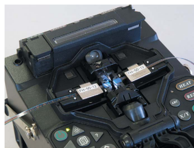
Top view of FSM-50R12