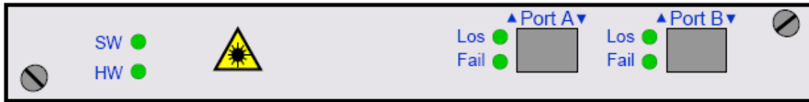
Figure 1: MS430580M front panel layout.

The MS430580M occupies one slot in the MICROSENS chassis. Line and Client interfaces are SFP cages capable of hosting standard SFP modules.