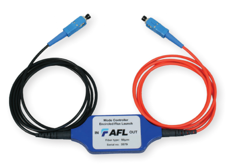
Encircled Flux (EF) Mode Controller

EF Compliant solutions available, see pages 3 - 4 for details