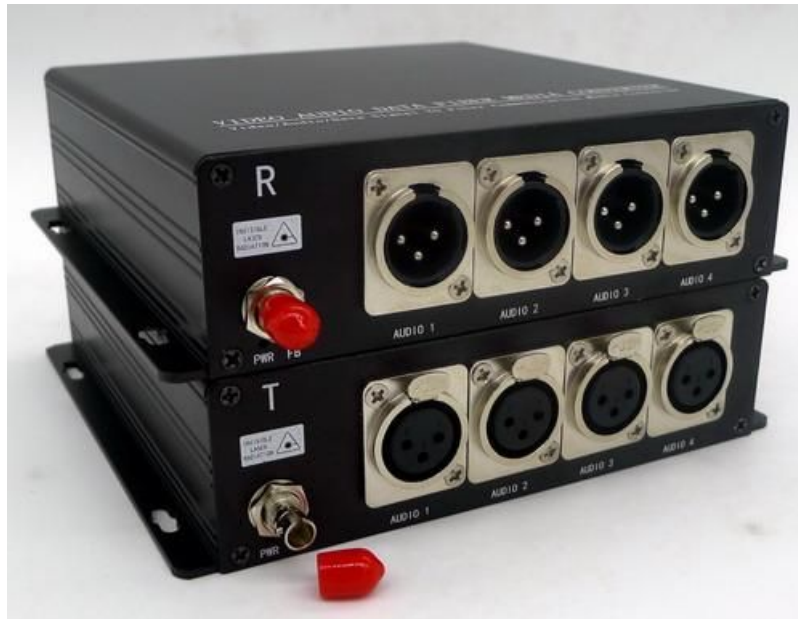
4 Channels Balanced Audio (XLR)To Fiber Optic