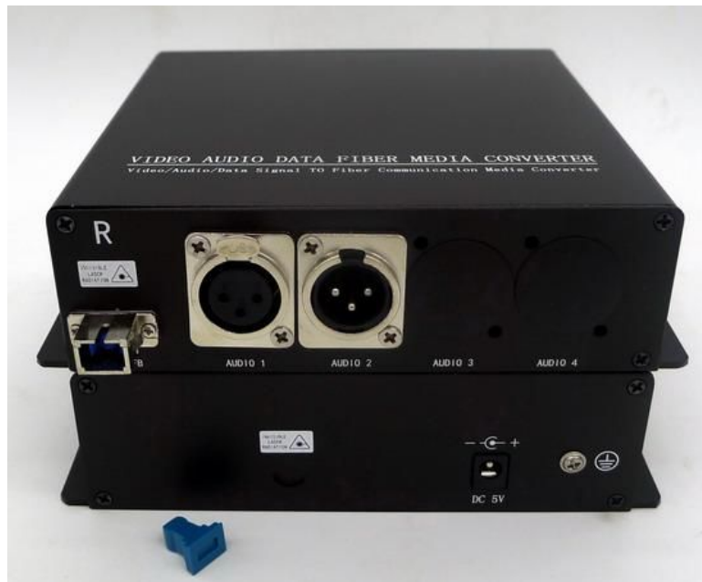
1 CH BIDI Balanced Audio (XLR) To Fiber Optic